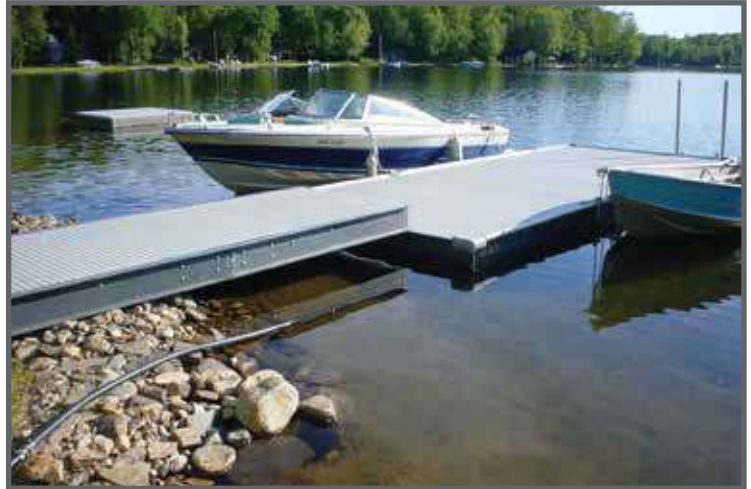
Boat dock on Horseshoe Lake in Haliburton, Ontario.

Aqua Grate T1210 and T1215 pultruded pedestrian grating is specifically engineered to withstand the corrosive conditions associated with recreational and general marine applications and to meet ADA guidelines. With its nominal 6.4mm space between the 38mm wide bearing bars, Aqua Grate offers optimum comfort and safety for bathers walking with bare feet — a must in high-traffic, public recreational areas. Aqua Grate grating has a unique combination of corrosion resistance and lightweight, which provides easy, inexpensive installations in facilities such as swimming pools, water parks, marinas, and piers.