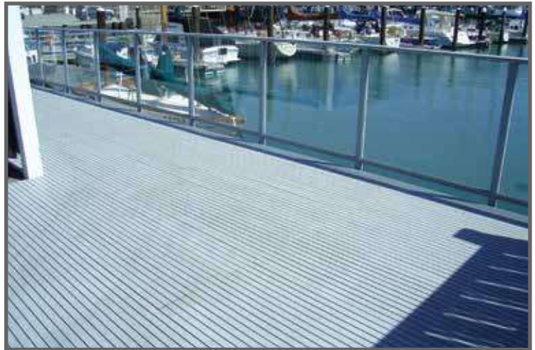
Corinthian Yacht Club Harbor in San Francisco, California.

Aqua Grate is available in various lengths and widths, making it suitable for a range of waterfront and recreational applications. The fine grit surface of Aqua Grate provides a high level of slip resistance, yet at the same time, offers a comfortable barefoot walking surface. Protection against long-term UV exposure is provided by a synthetic surfacing veil and UV inhibitors in the resin formulation. Whether subjected to chlorinated water in public and private pools or saltwater environments found in marine and waterfront applications, Aqua Grate will provide years of low-cost, low-maintenance service.